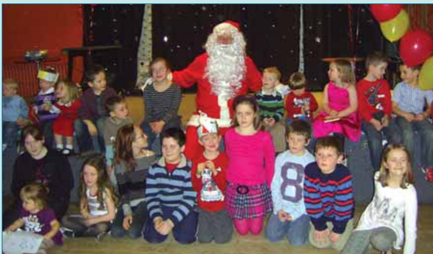
Santa takes centre stage amongst the less reticent children